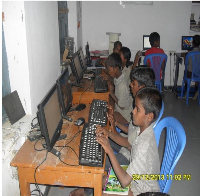
Digital Literacy Center Developed in Burgula in 2013