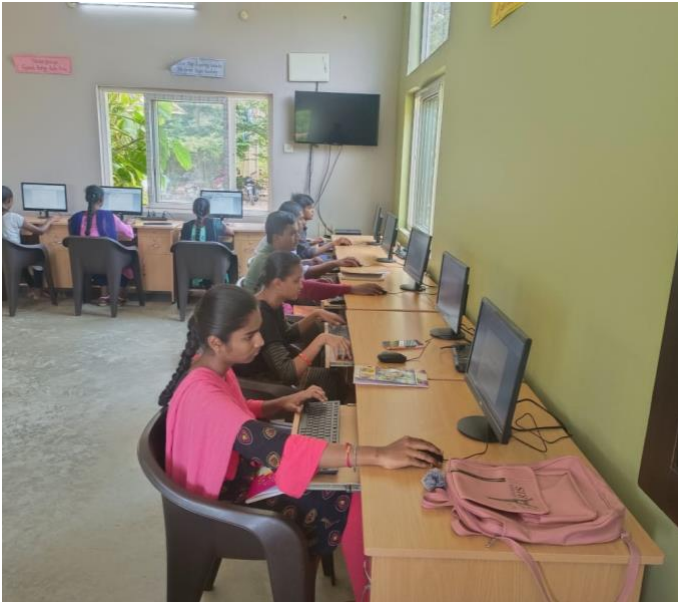
Surging Ahead with “State of the Art” in Pragathi Rural Development Center, Burgula, Telangana in 2023