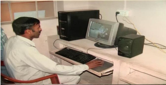
Rural Digital Revolution Started in Haryana in 2003