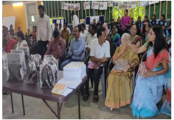
Mandal Awards Ceremony 2018 - Recognizing Outstanding Students, Teachers and School Heads