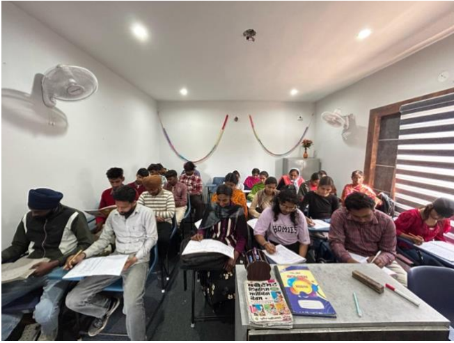
In Punjab, 378 Underprivileged Students Being Prepared For Getting Admission Into Highly Competitive Fields